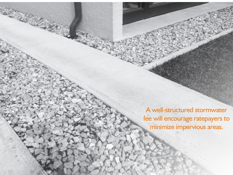
A well-structured stormwater fee will encourage ratepayers to minimize impervious areas.

One serious drawback to this method is that it doesn't account for a property's pervious area. This limits the method's effectiveness in gauging the actual runoff a property generates. For instance, a 3,000-square-foot house on a parcel with 2,000 square feet of pervious area will generate less runoff than the same house on a lot with only 500 square feet of pervious area, because the pervious area captures runoff. But under the Total Impervious Area method, both properties would pay the same fee.