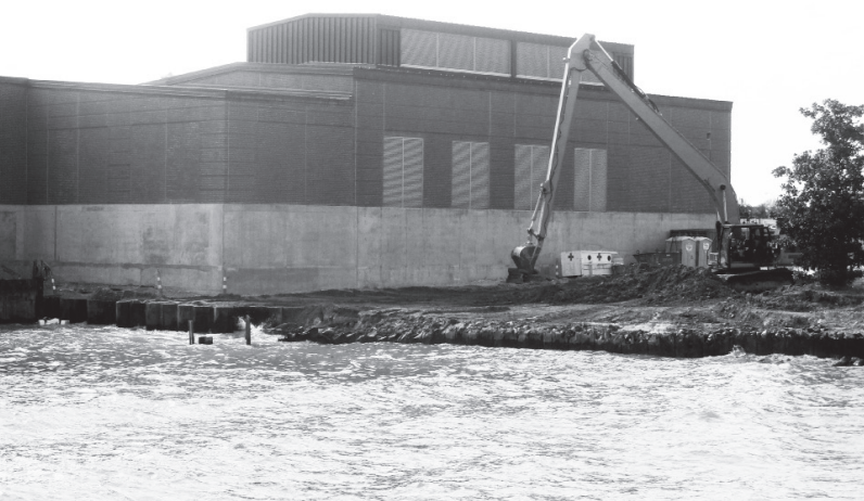
Construction underway at the Orleans Avenue outfall canal pump complex.

In summary, to maximize the reach of a stormwater fee to properties beyond traditional ad valorem taxation there must exist a strong nexus between the property's runoff and the amount of the charge. Also, fee revenue must go solely to stormwater management that benefits ratepayers.