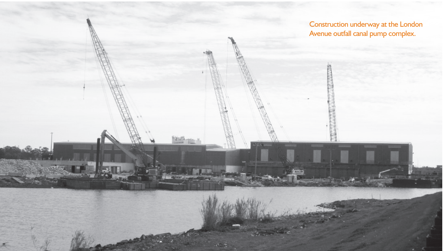
Construction underway at the London Avenue outfall canal pump complex.

Finally, the City Council should pursue a charter change clarifying the authority of, and process for, the City and S&WB to impose fees and service charges.