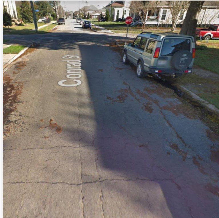
Existing conditions on the 700 block of Conrad Street.