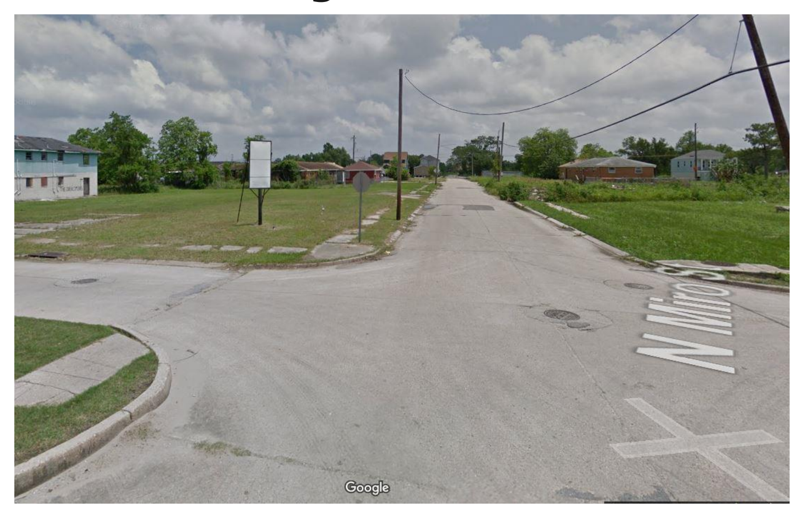
Existing condition at Caffin Ave. and N. Miro St.