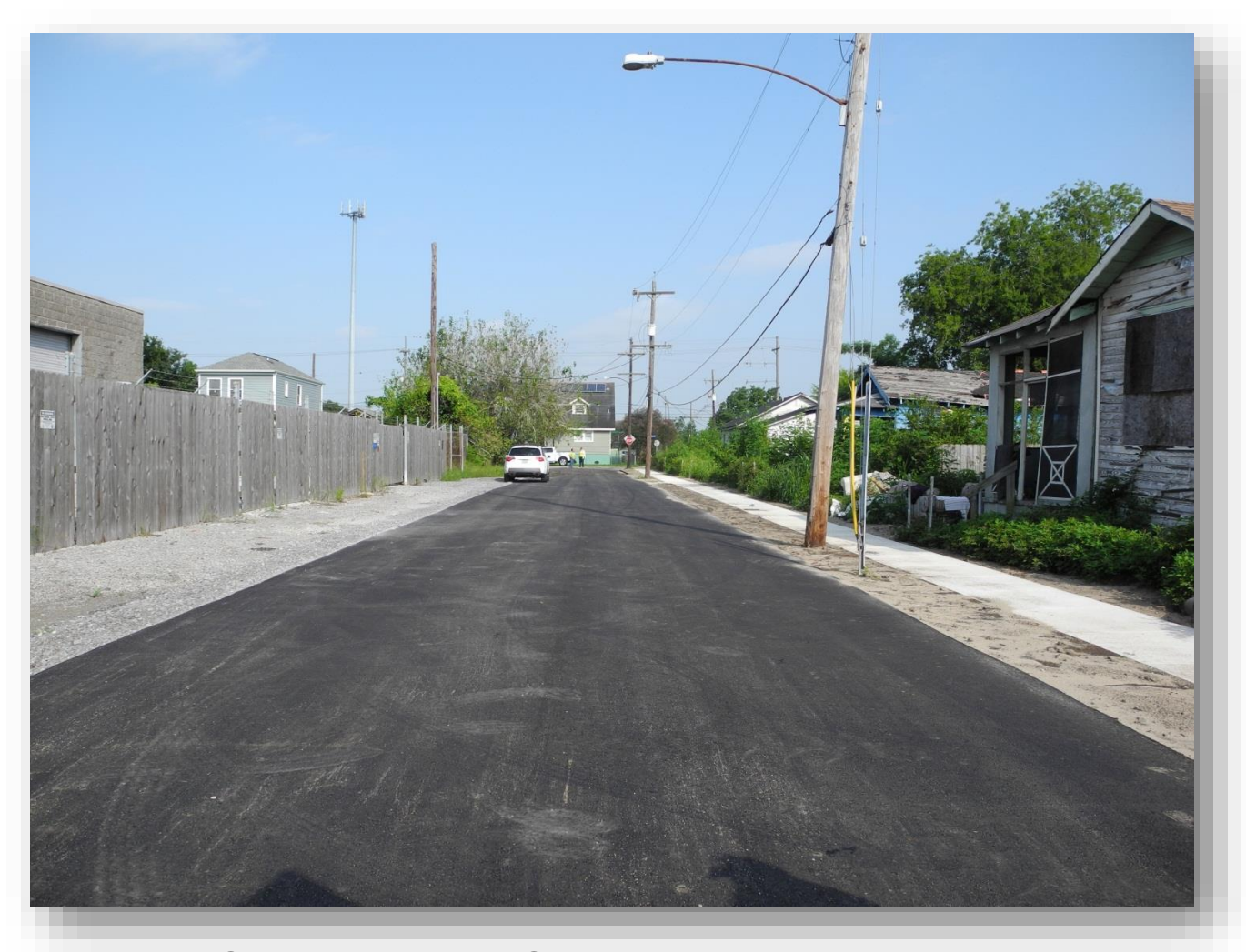
Marais St. from Delery St. to the Parish Boundary was re-paved in the summer of 2012.