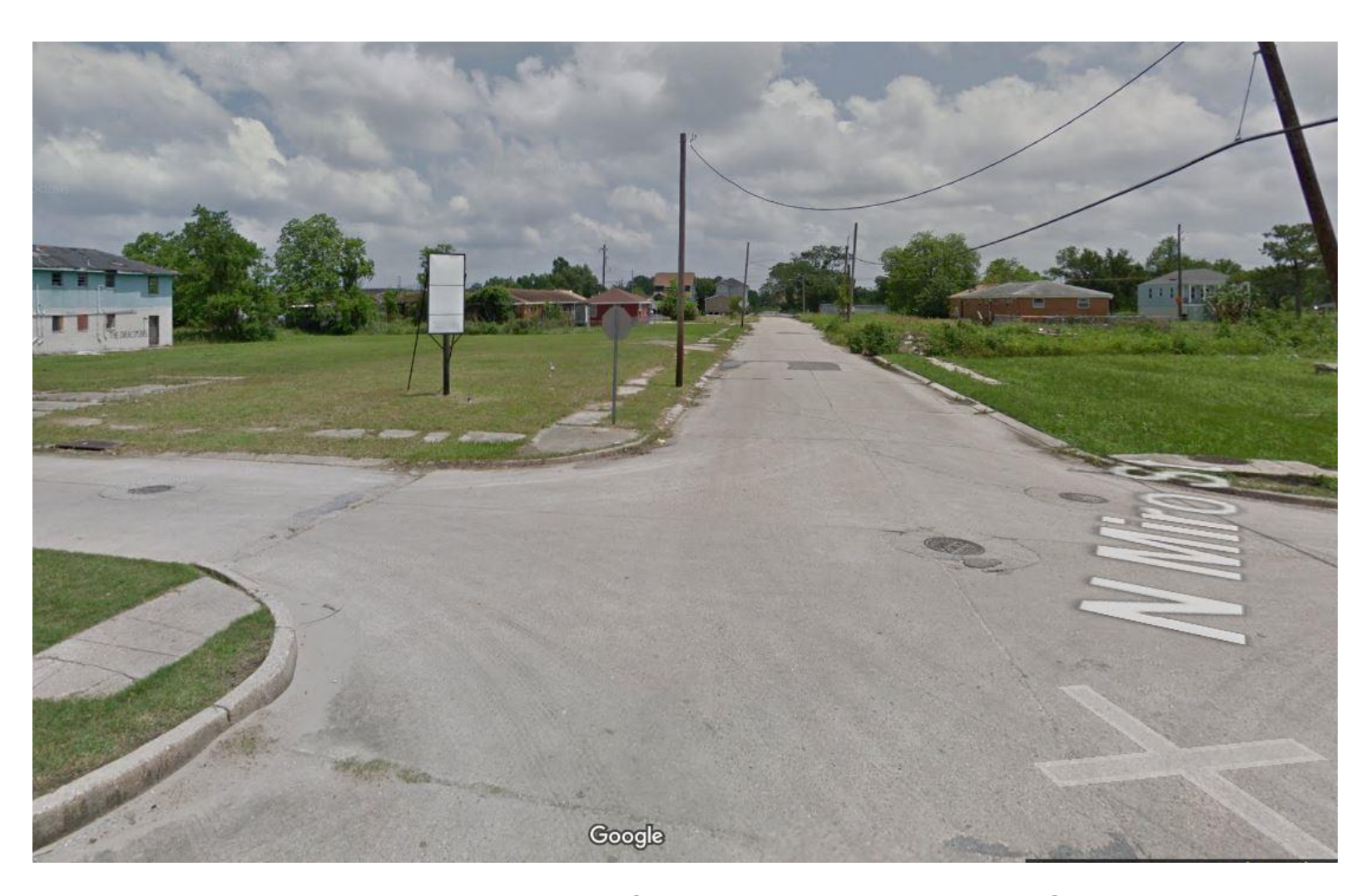
Existing condition at Caffin Ave. and N. Miro St.