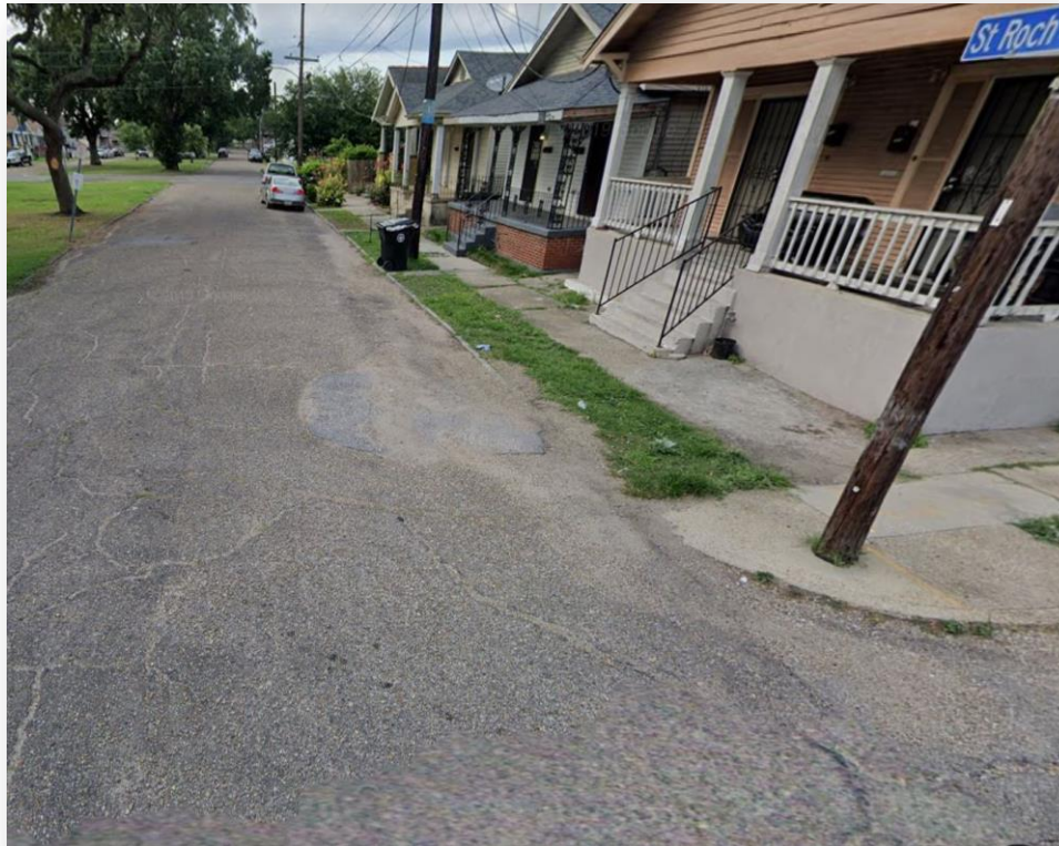
Existing condition on Peace Court.