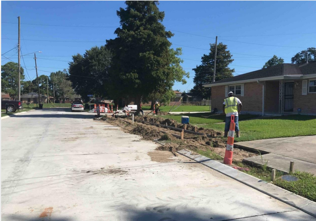
An example of a repaved block on the recently completed Read Blvd. West Group A project.