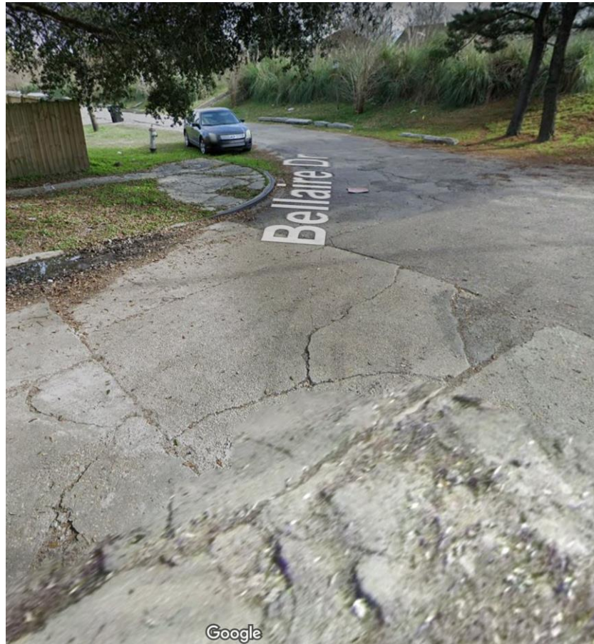
Existing condition of the 6000 Bellaire Dr.