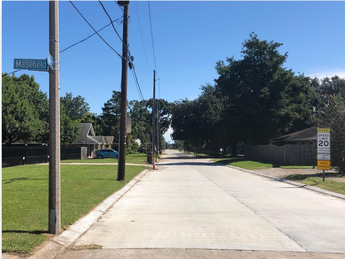
An example of a repaved area on the Little Woods Group A project.