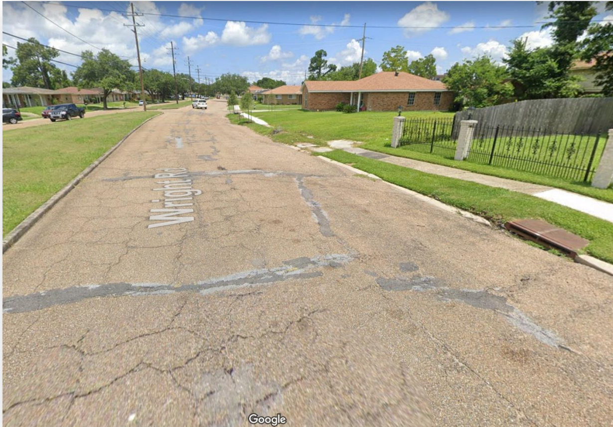
Existing conditions in the 4500 block of Wright Road