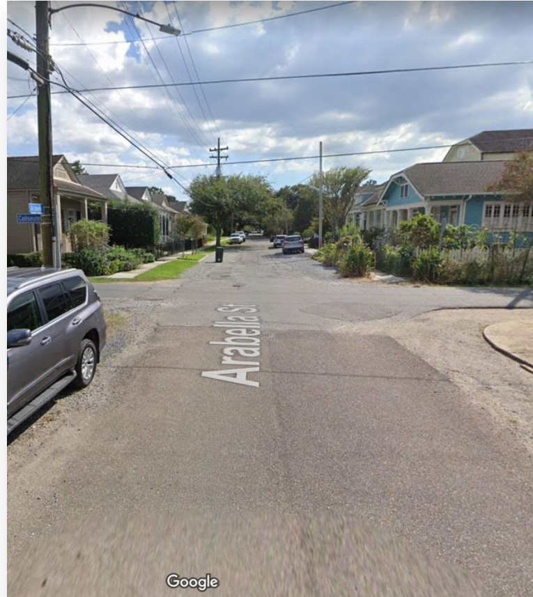
Existing conditions at the intersection of Arabella St. and Coliseum St.