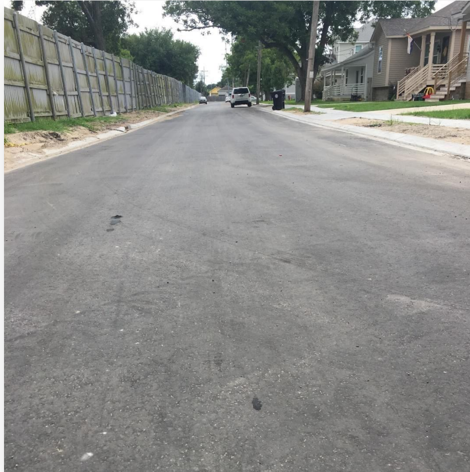
An example of a repaved area of Kenilworth St. from a recently completed project in Lakeview.