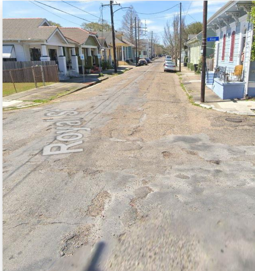
Existing condition of the intersection of Royal St. and Alvar St.