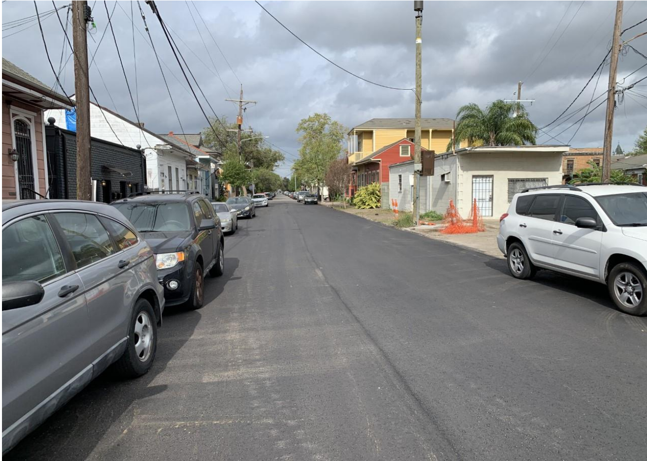
An example of a repaved area of St. Roch St. from a recent project.