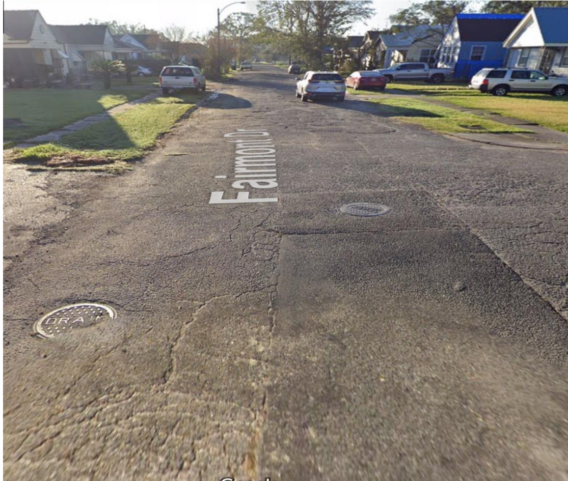
Existing conditions in the 3700 block of Fairmont Drive