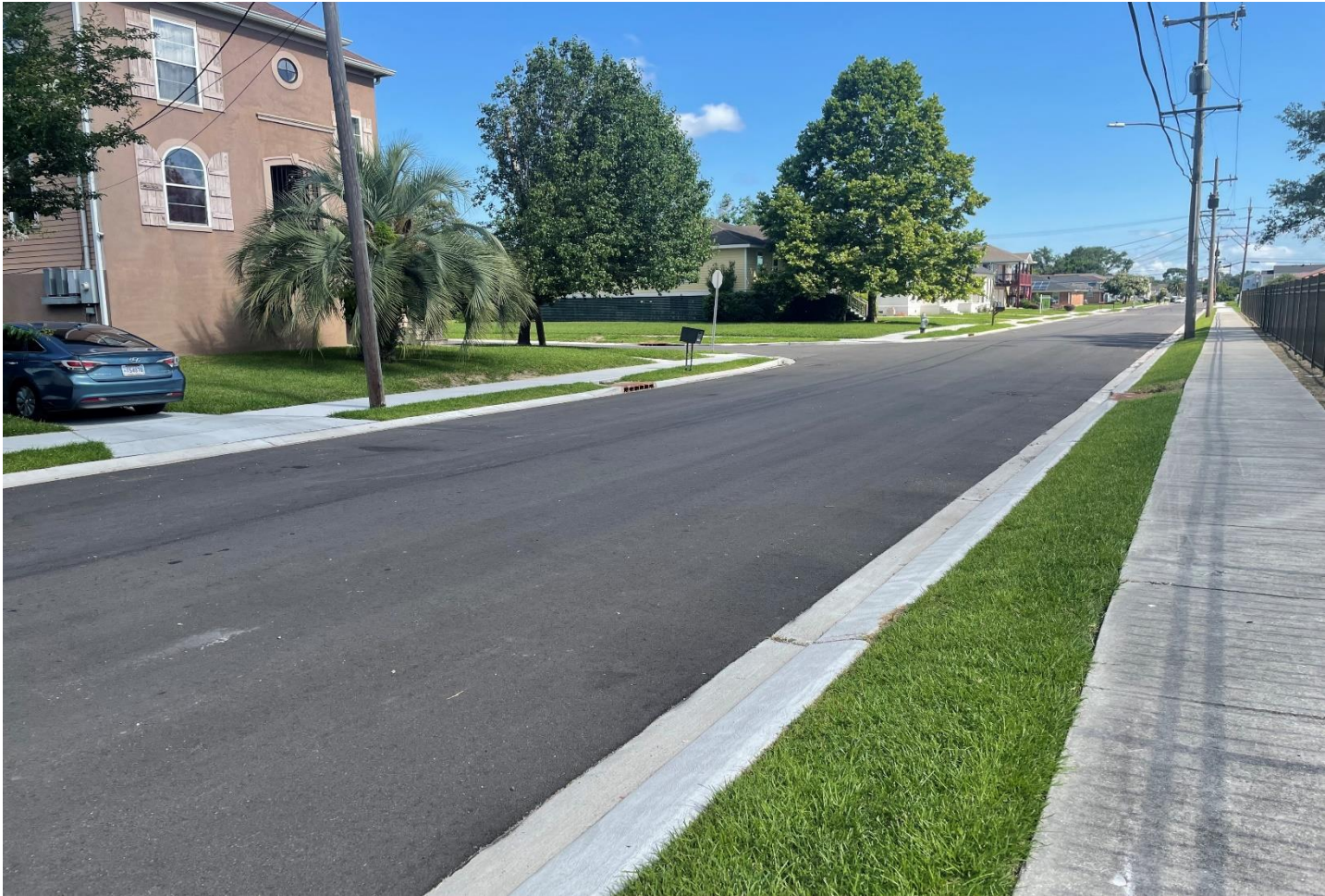
An example of a completed area of the 5700 of Mandeville Street on the Milneburg Group B Project.