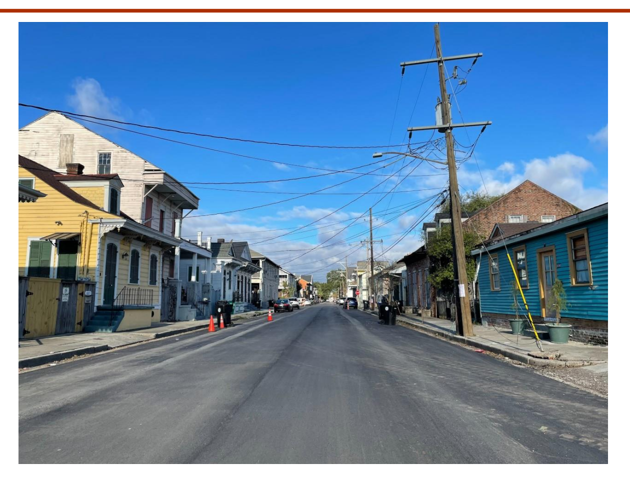
An example of an asphalt paved street: Treme Street in the Treme-Lafitte Group B project.