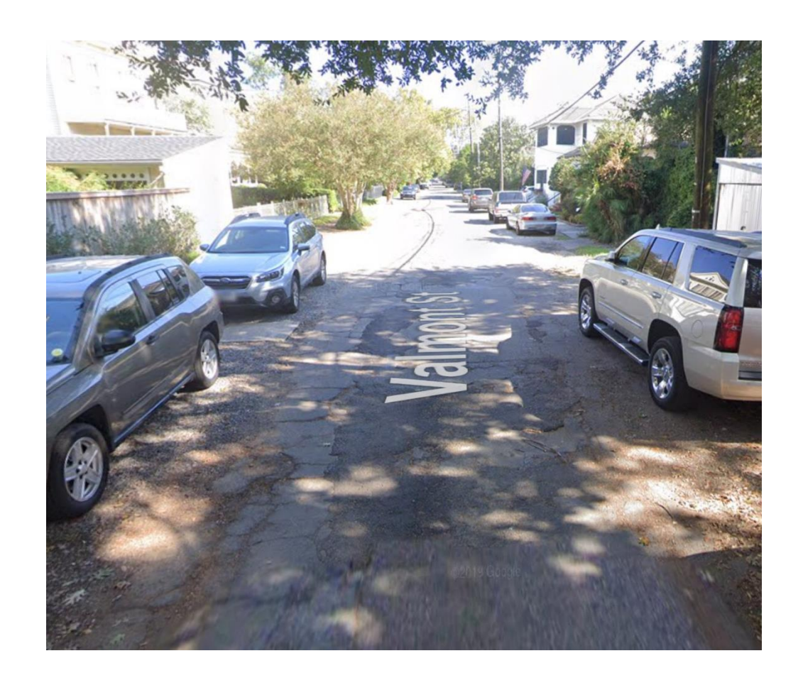
Existing conditions in the 1000 block of Valmont St