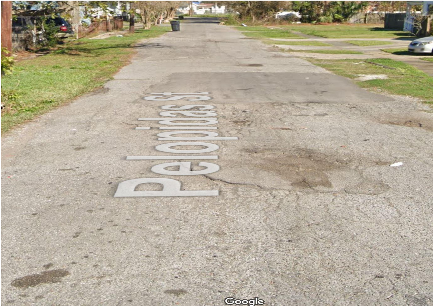
Existing conditions in the 1900 block Pelopidas Street