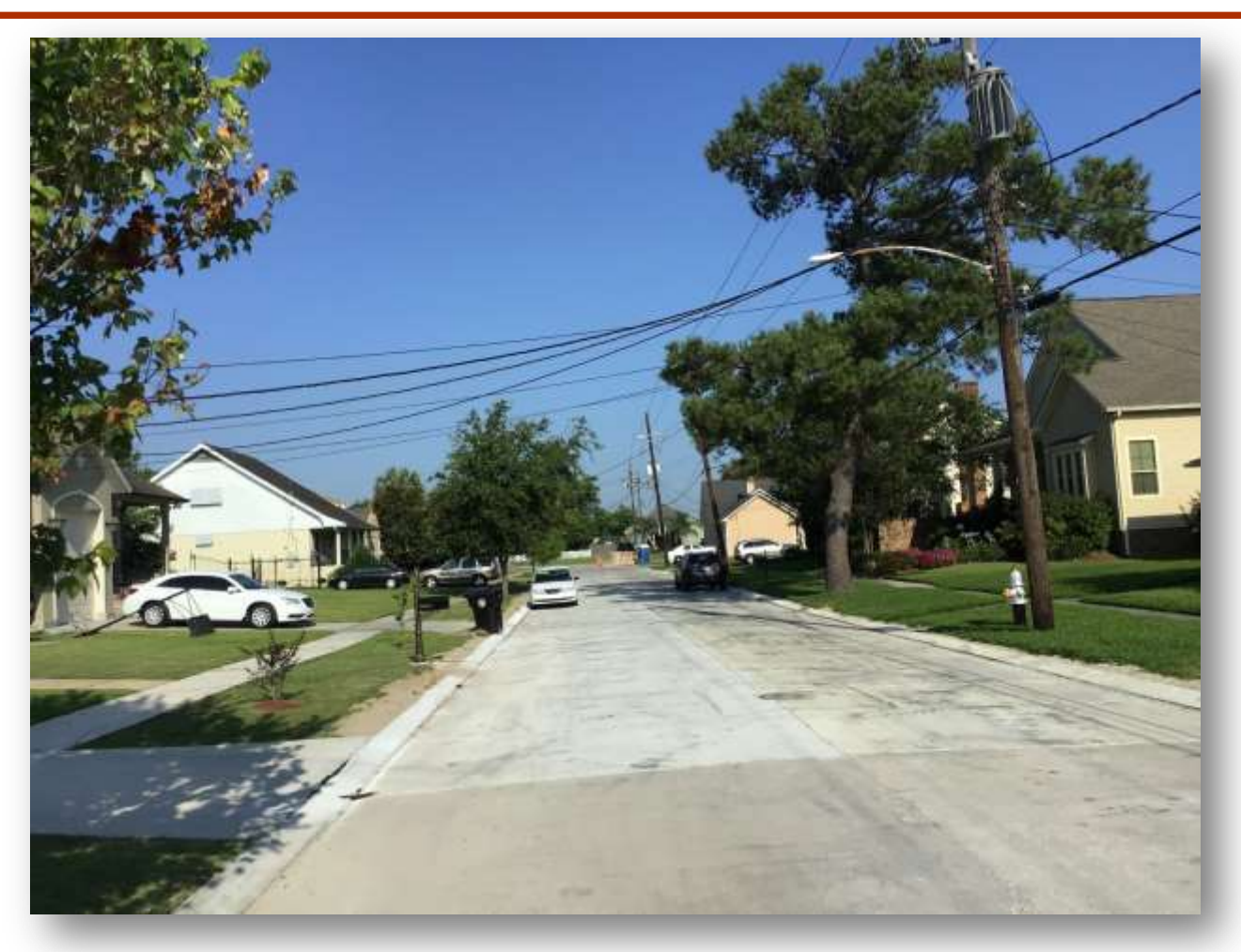
An example of a completed area of completed street on the West End Group A Project.