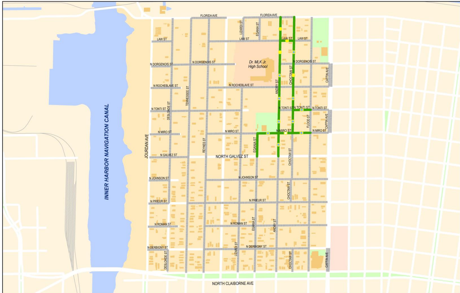
ROAD WORK CITY OF NEW ORLEANS RR111: Lower Ninth Ward Northwest Group D (FRC) Capital Improvement Program/City of New Orleans Department of Public Works: November 2020