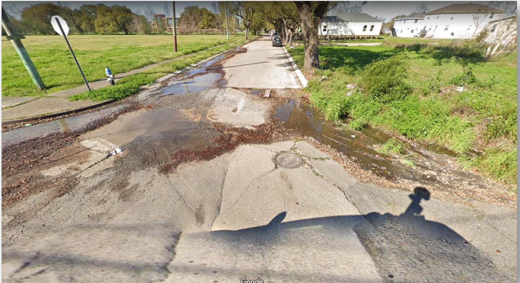
Existing conditions on Andry Street.