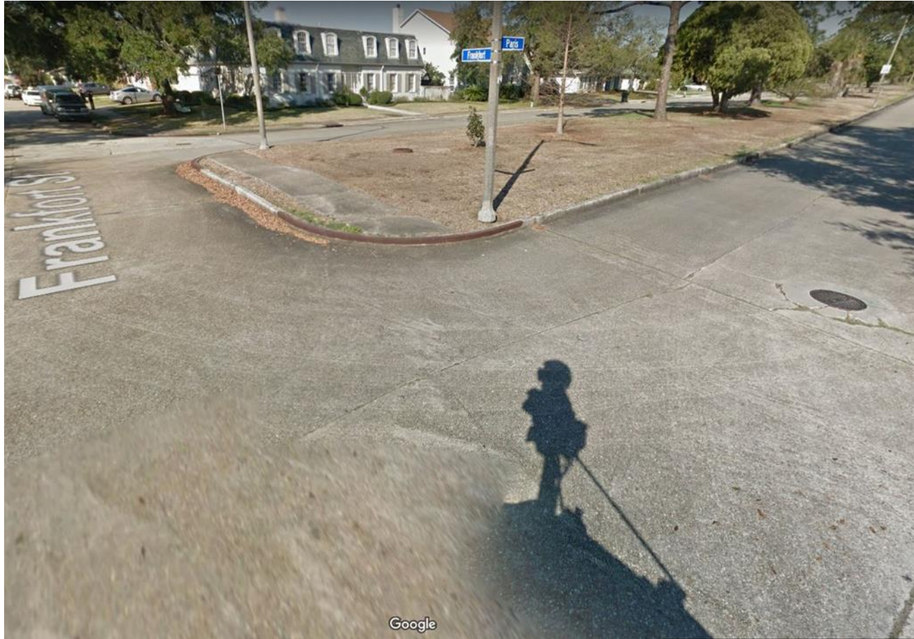
Existing condition Frankfort St. and Paris Ave.