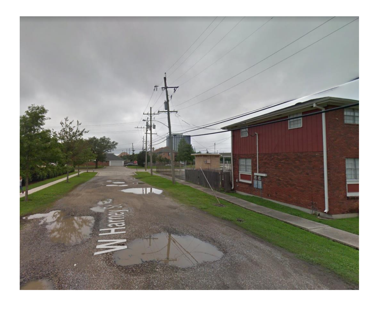
Existing condition of W. Harney St.