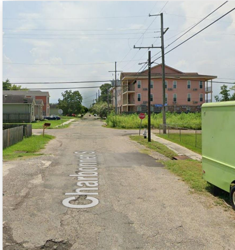
Existing condition of the 1500 block of Charbonnet Street.