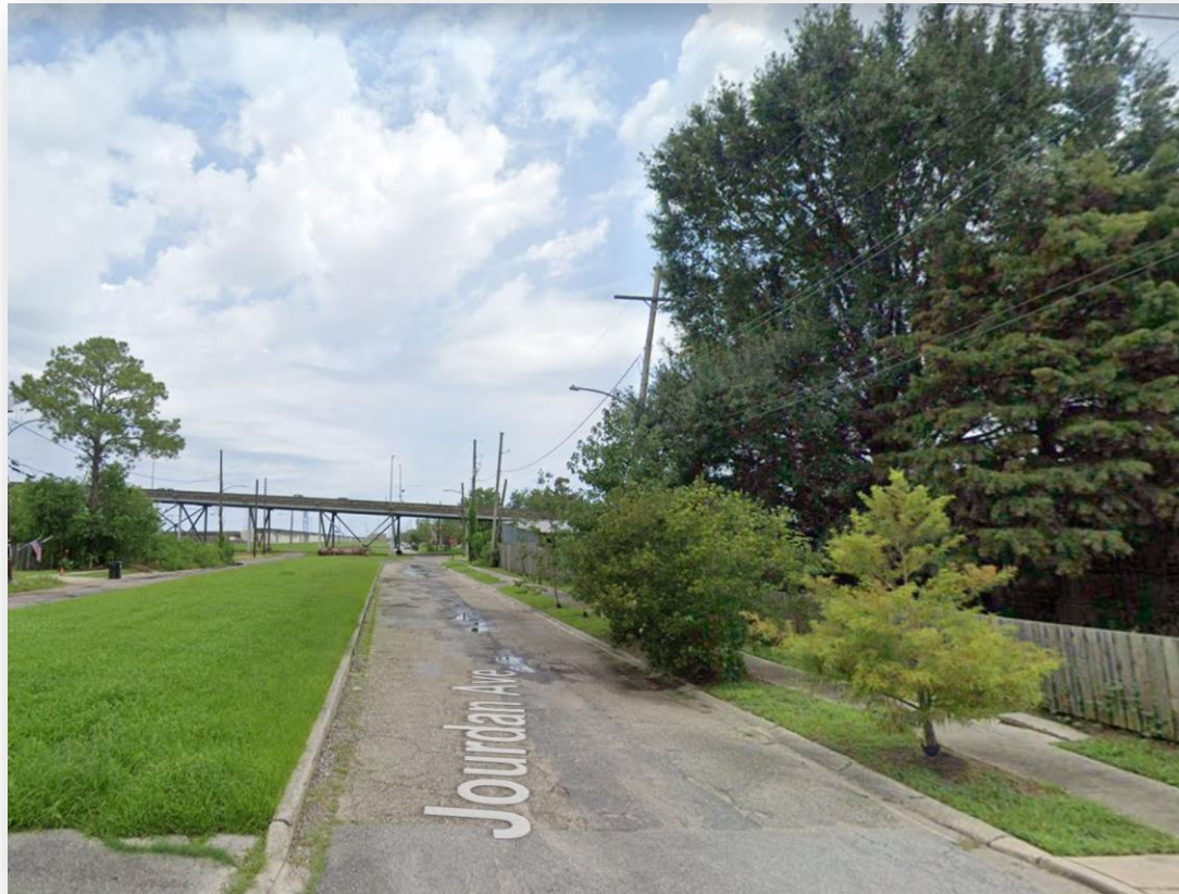
Existing condition of Jourdan Avenue at S. Robertson Street.