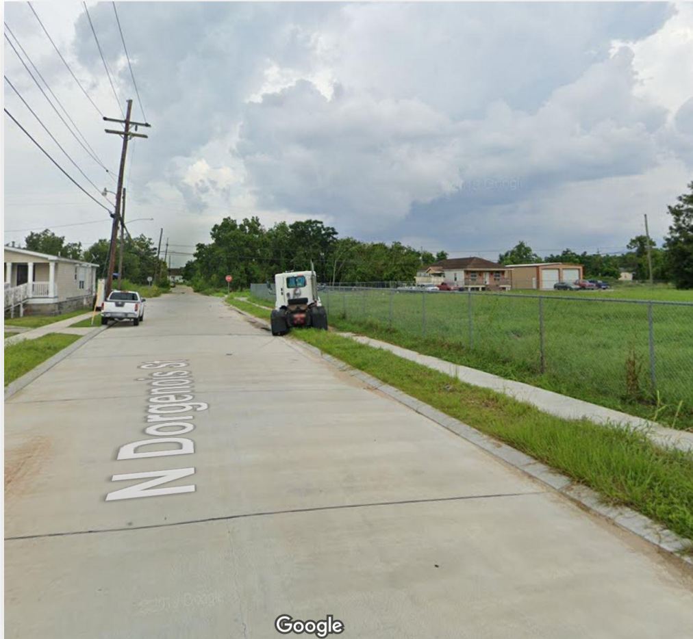
An example of a repaved area of N. Dorgenois St. from the recently completed Lower Ninth Ward Northeast Group A Project.