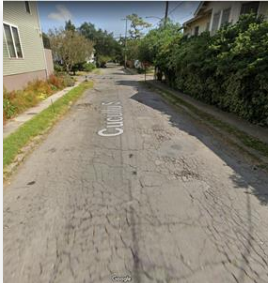
Existing condition of the 5500 block of Cucullu Street